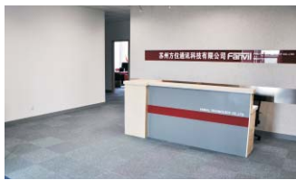
▲ Suzhou branch