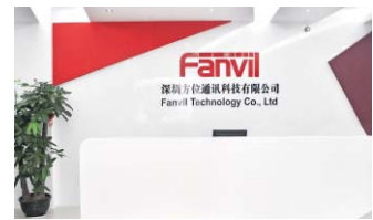
▲ Shenzhen corp