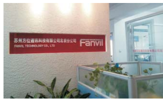
▲ Beijing branch