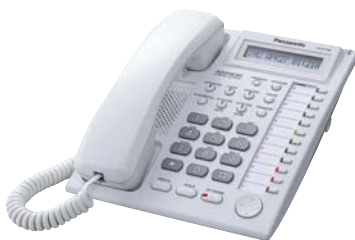
■ KX-T7730 LCD, Speakerphone Unit

* An optional card is required. Please contact your dealer or phone company to confirm if the Caller ID service is available in your area.